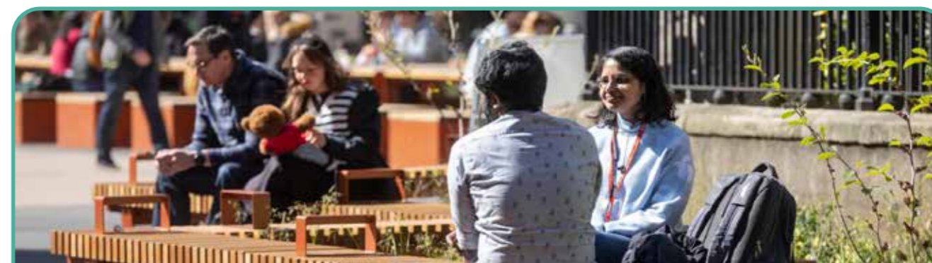
Improving the High Street Precinct Area

A key location along the road is the Dock Road junction, which leads you down to the Docks. The Victorian architecture of adjoining buildings and green spaces create a nice environment, but this could be enhanced through public art and wayfinding to better direct people. Consideration should also be given to cycle and pedestrian access between the B5129, the National Cycle Route and Wales Coast Path.