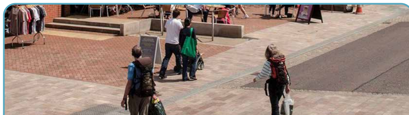
Improving the Main Road (B5129) through Connah's Quay

The B5129 runs through the heart of the town, but does little to announce or celebrate the town. It tends to be a functional, but car-dominated space that offers limited high quality spaces for people. The street needs to be a place of life and activity, where residents of the town and come together.