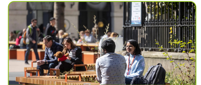
A Social Heart

The location of Shotton alongside the River Dee, a number of national and long-distance trails and a train station that connects the North Wales Coast with the Borderlands is unique. The proximity of the town centre to the train station needs to be opened up, with Transport for Wales's (TFW) planned investment in the interchange and stronger promotion of Shotton being on the Wales Coastal Path, national Sustrans routes, the Chester Millennium Gateway route and the local active travel network.