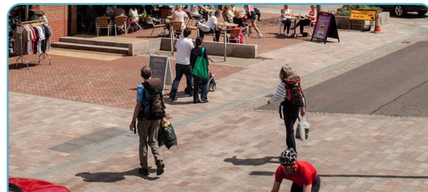
From a Road into a Street

Shotton town centre is a key destination as the main retail and services hub for the local and wider community. The town centre has some of the key heritage and identifying buildings within the town. However, the centre suffers from a lack of overall character and a confusing street scene, resulting in these key assets becoming lost within the street.