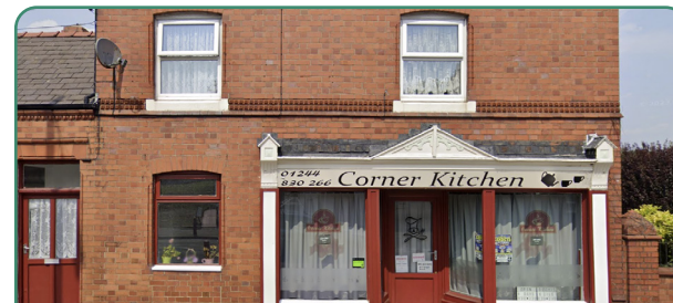
A Design Code for Shotton

The opportunity exists to create a harmonious and unified town centre which furthers the needs of the businesses and people using it. This will include creating a more pedestrian friendly environment, encouraging more activity through seating and spill out spaces, improving quality of the environment and creating a more social place.